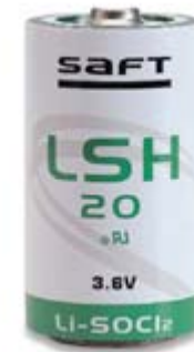
D-size, Primary lithium-thionyl chloride battery, Nominal voltage: 3.6V, Capacity: 13.0Ah

Infinite's autonomous RTUs utilize a dual processor architecture in order to combine extreme low power consumption with advanced processing and communication characteristics.