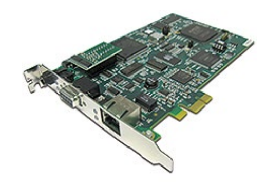
Brad® applicom™ Ethernet NIC