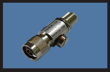
4) Accessories – GPS Surge Arester