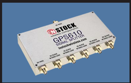
3) Accessories - GPS Signal Splitter 1 to 6