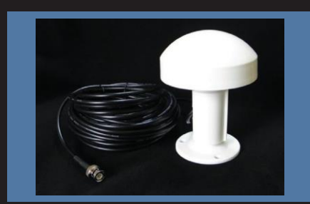
2) Accessories - Antenna 38db (30m)