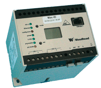
- Ethernet version -