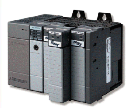
- AS-Interface for A-B SLC -