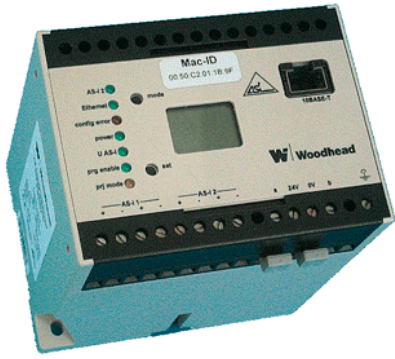
- AS-Interface gateways -