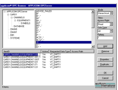
- Browsing of OPC Server -

The core of BradCommunications™ Direct-Link™ PC Network Interface cards lies in effective software tools enabling fast integration of industrial communication into your applications.