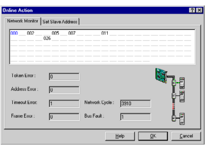
- Profibus Network Monitoring -