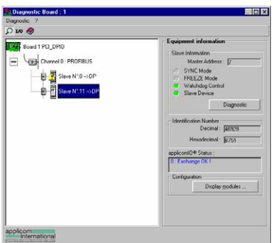
Troubleshooting & Testing tool –