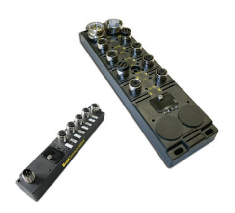
Brad® Direct-Link® Harsh Duty Switches

5-Port Modules 112111 112105 8-Port Modules